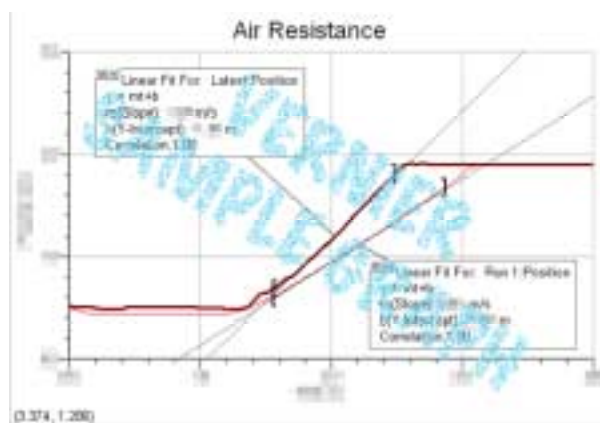
Typical position vs. time graphs